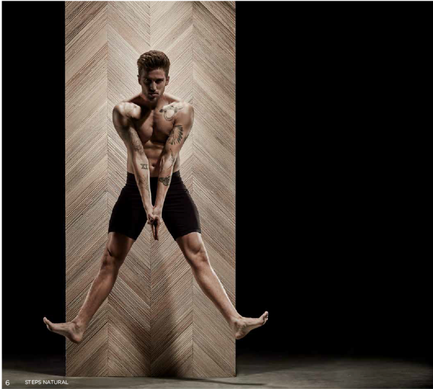
6 STEPS NATURAL